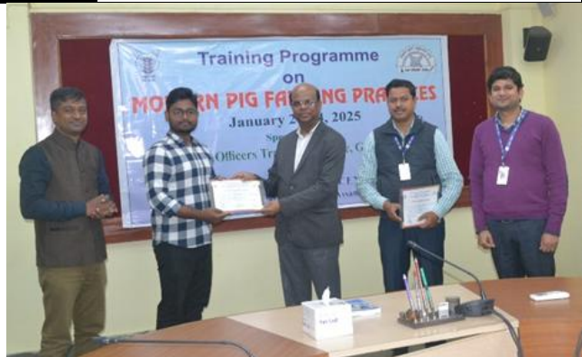
Certificate Distribution to the participants