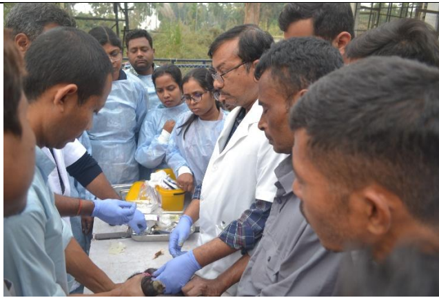
Practical Demonstration to the participants