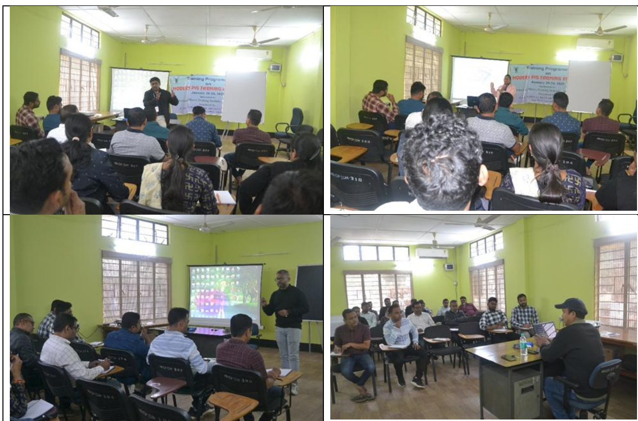
Lectures delivered by Scientists on different aspects