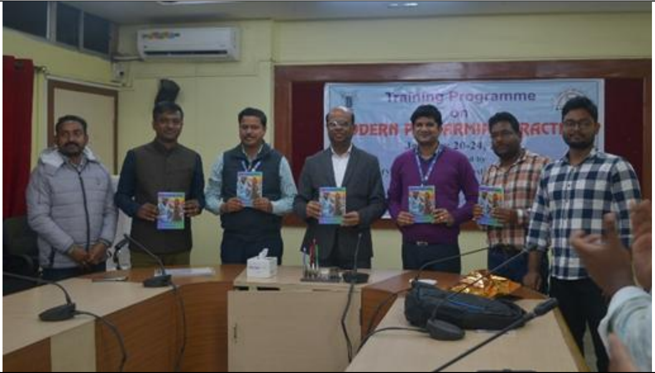
Release of training material on “Modern Pig Production Practices: A Comprehensive Guide for veterinarians