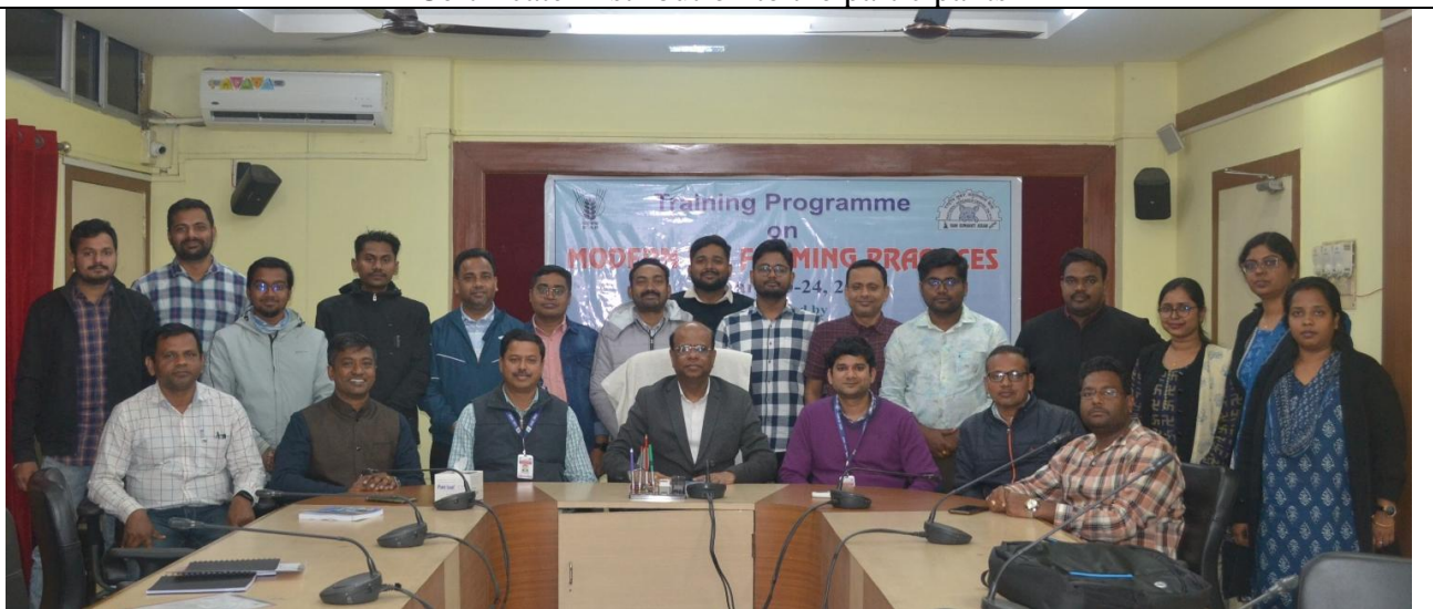
Group Photograph of Director with trainees